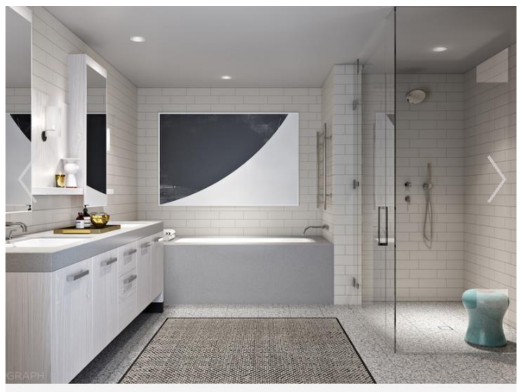
Ba throom. KILOGRAPH