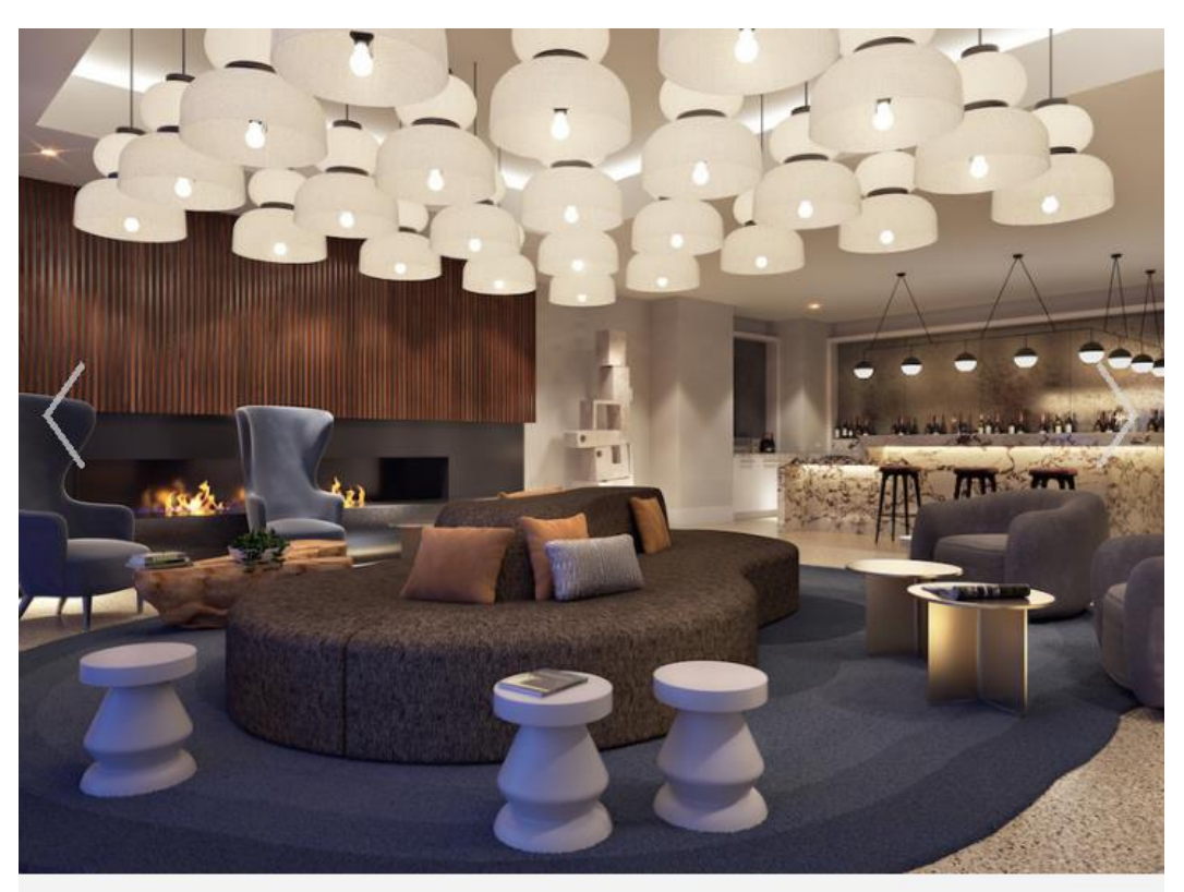
Clublounge with a fireplace. KILOGRAPH