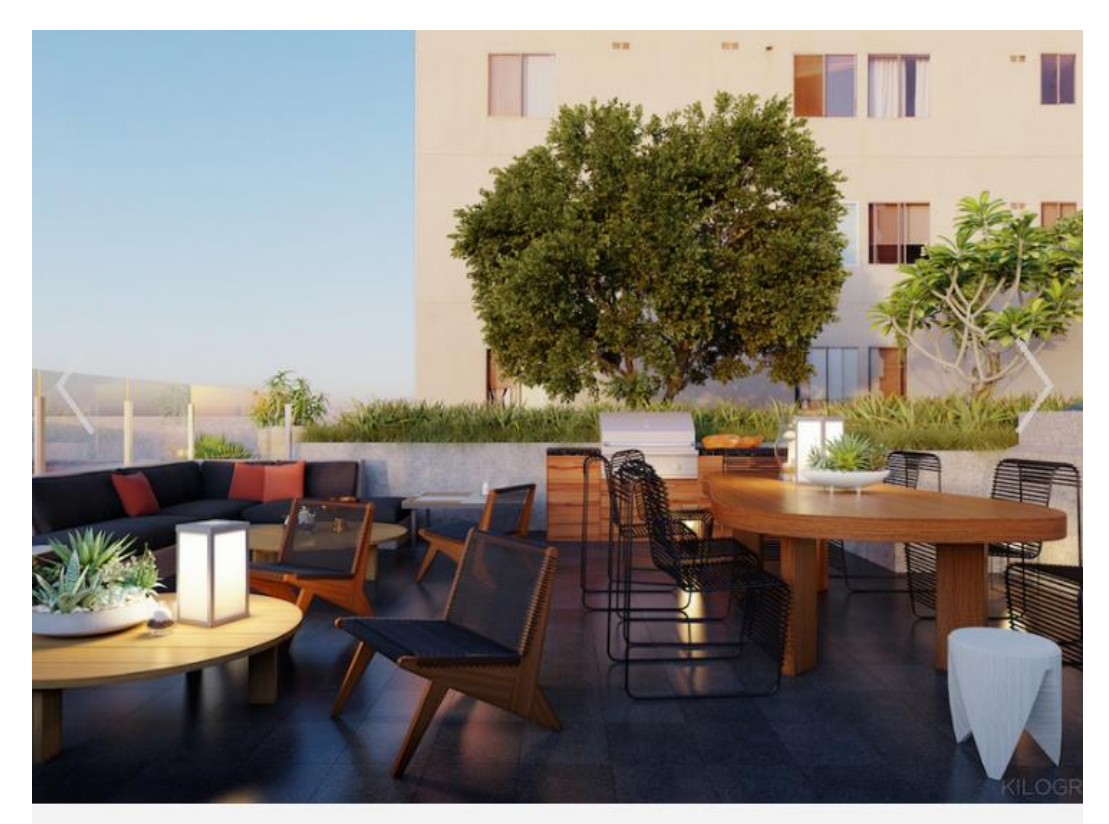
Private terrace. KILOGRAPH